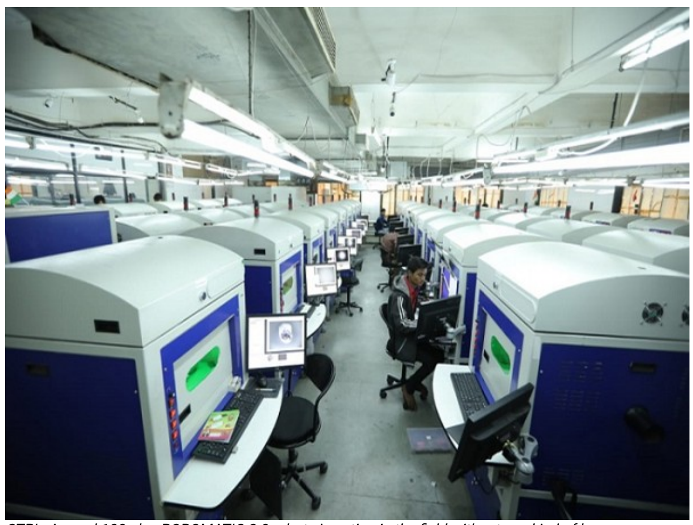
STPL: Around 100 plus ROBOMATIC 2.0 robots in action in the field without any kind of human intervention