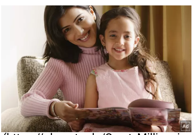
(https://olymptrade/Surat_Millionaire _Mom_Exposes_How_To_Make_Lakh s_Per_Month)

Surat Millionaire Mom Exposes How To Make Lakhs Per Month (https://olymptrade/Surat_Millionaire_Mom _Exposes_How_To_Make_Lakhs_Per_Month