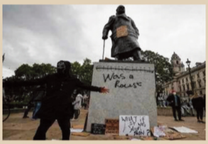
London, June 8 (IANS) Thousands of protesters took to the streets of London on Sunday, rallying for a second day running to condemn police brutality after the killing of the unarmed black man, George Floyd, in Minneapolis, the US, on May 25. An estimated 10,000 people gathered in the city to demonstrate against the killing